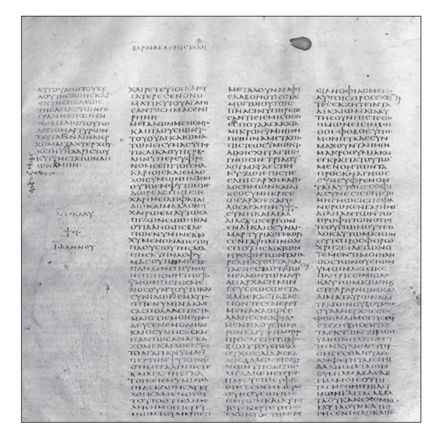
The Codex Sinaiticus, the oldest surviving manuscript of the entire New Testament. This fourth-century manuscript includes The Shepherd of Hermas and the Epistle of Barnabas (the first page of which is pictured here), books that were considered part of the New Testament by some Christians for several centuries.