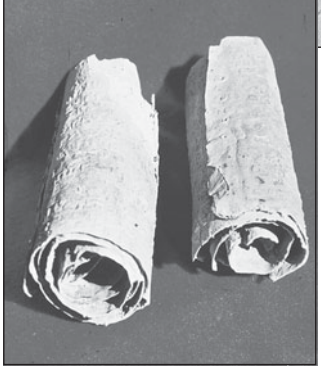
Some of the caves ( above ), in the wilderness west of the Dead Sea near the Qumran community, in which the Dead Sea Scrolls ( two shown at left ) were found.

Every book of the Hebrew Bible is represented among the manuscripts discovered in the eleven caves, with the exception of the book of Esther. This discovery of biblical manuscripts is significant because prior to this, our oldest copy of the Hebrew Bible came from 1000 CE; these copies among the Dead Sea Scrolls were a millennium or more older than anything previously known to exist. And so we are able to tell how faithfully the texts of the Hebrew Bible were copied over the ages. As it turns out, some of the texts (for example, Isaiah) were copied with high accuracy, century after century; others (including the books of Samuel, for